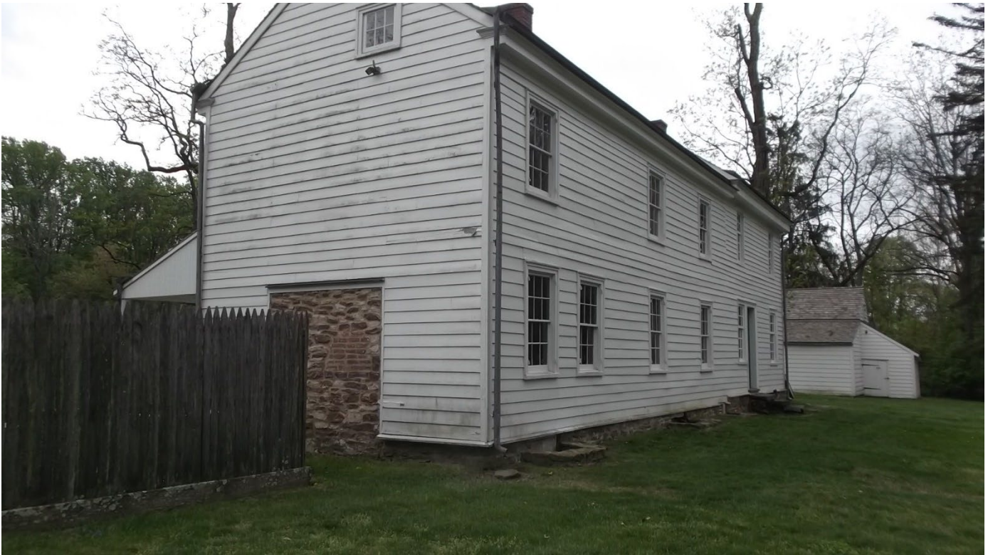
Other side of Clarke House. ADA accessible pathway will not be required on this side. Carriage Barn in background to the right.