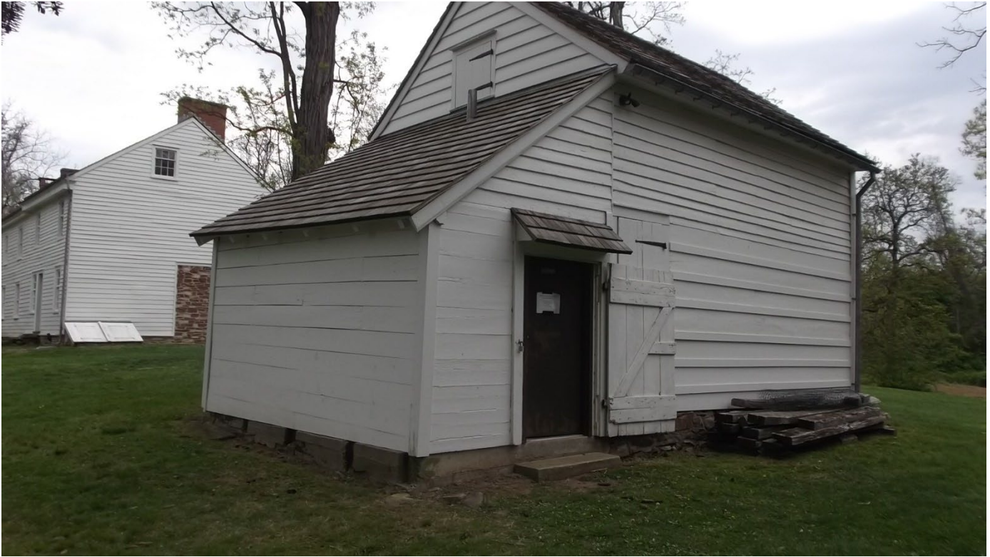
Restroom attached to Carriage Barn. Clarke House in background. Photo taken from direction of parking lot. ADA path will extend from here to the right and around back to Clarke House.