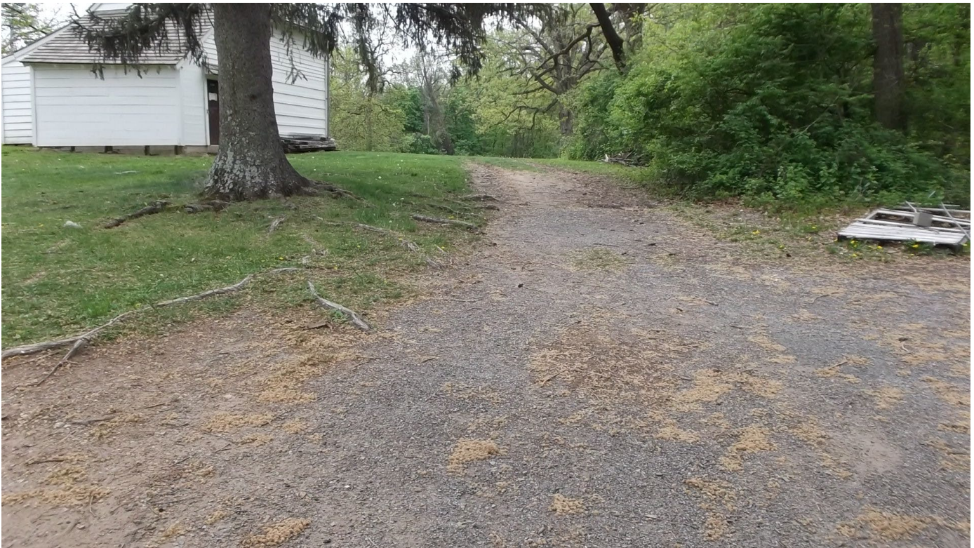
View of Carriage Barn and restroom from parking lot (to be upgraded by others).