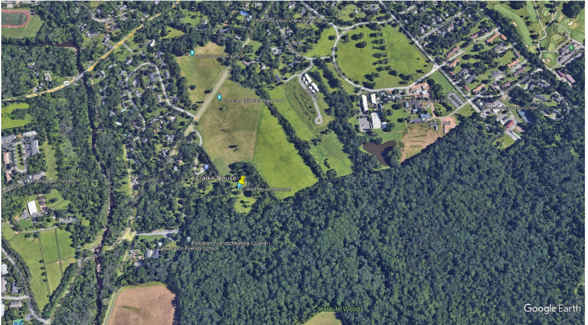
Project Site Location Map Clarke House - Princeton Battlefield State Park EXHIBIT 'B'