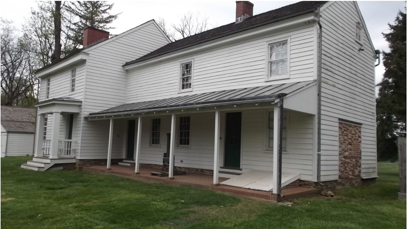
Clarke House at Princeton Battlefield State Park. An ADA accessible pathway will be required in this area. Carriage Barn in background to the left.